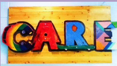
Thanks for Reading our Newsletter!!!